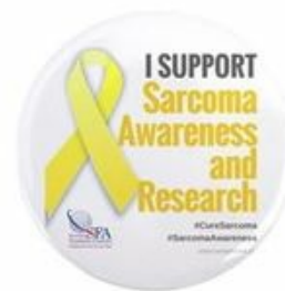
I Support Sarcoma Awareness Button

Browse our new selections and support our mission by shopping at http://www.cafepress.com/curesarcoma .